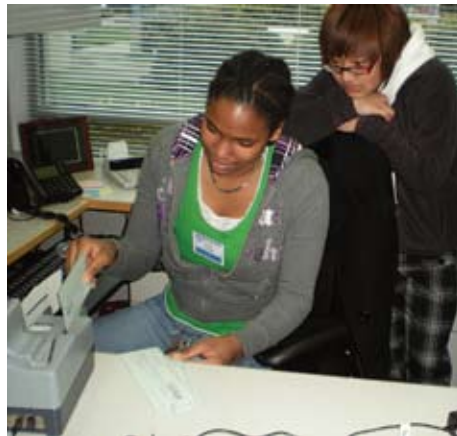
Students learn about technological advances in banking

They spent time at the Lacey Branch and Item Processing Center in Tacoma, learning about technological advances in banking such as our remote deposit service, Business Deposit Manager , where customers can deposit checks electronically from their office. The students also learned how to open new accounts, process customer deposits and interact with customers.